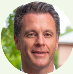
The Hon Chris Minns MP Premier of New South Wales