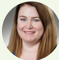
Tara Moriarty MP Minister for Agriculture, Minister for Regional New South Wales and Minister for Western New South Wales