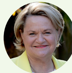
Wendy Tuckerman MP Shadow Minister for Local Government and Shadow Minister for Small Business