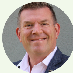
Dugald Saunders, MP Shadow Minister for Regional NSW and Shadow Minister for Agriculture and Natural Resources