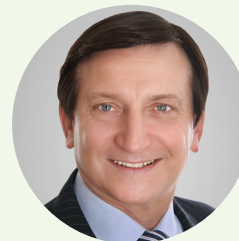
Ron Hoenig MP Minister for Local Government and Leader of Government Business